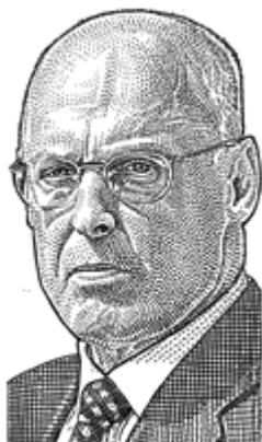
Henry M. Paulson

"For some time, I've been saying the markets are reassessing risk. The complexity of some of the products and the degree of global integration of the markets means this will continue to take a while. There will be volatility and unpleasant surprises. I continue to be focused primarily on the orderliness of the markets because I think the extent of repricing mitigates the inevitable drag on the economy."